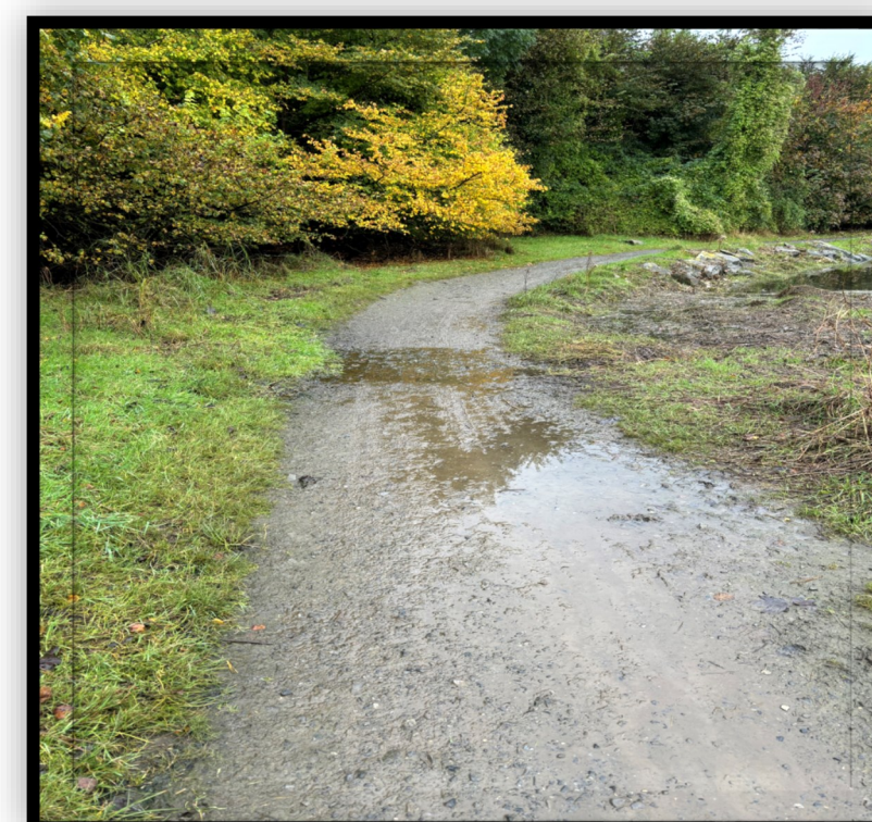
Section of Quiet Street Route